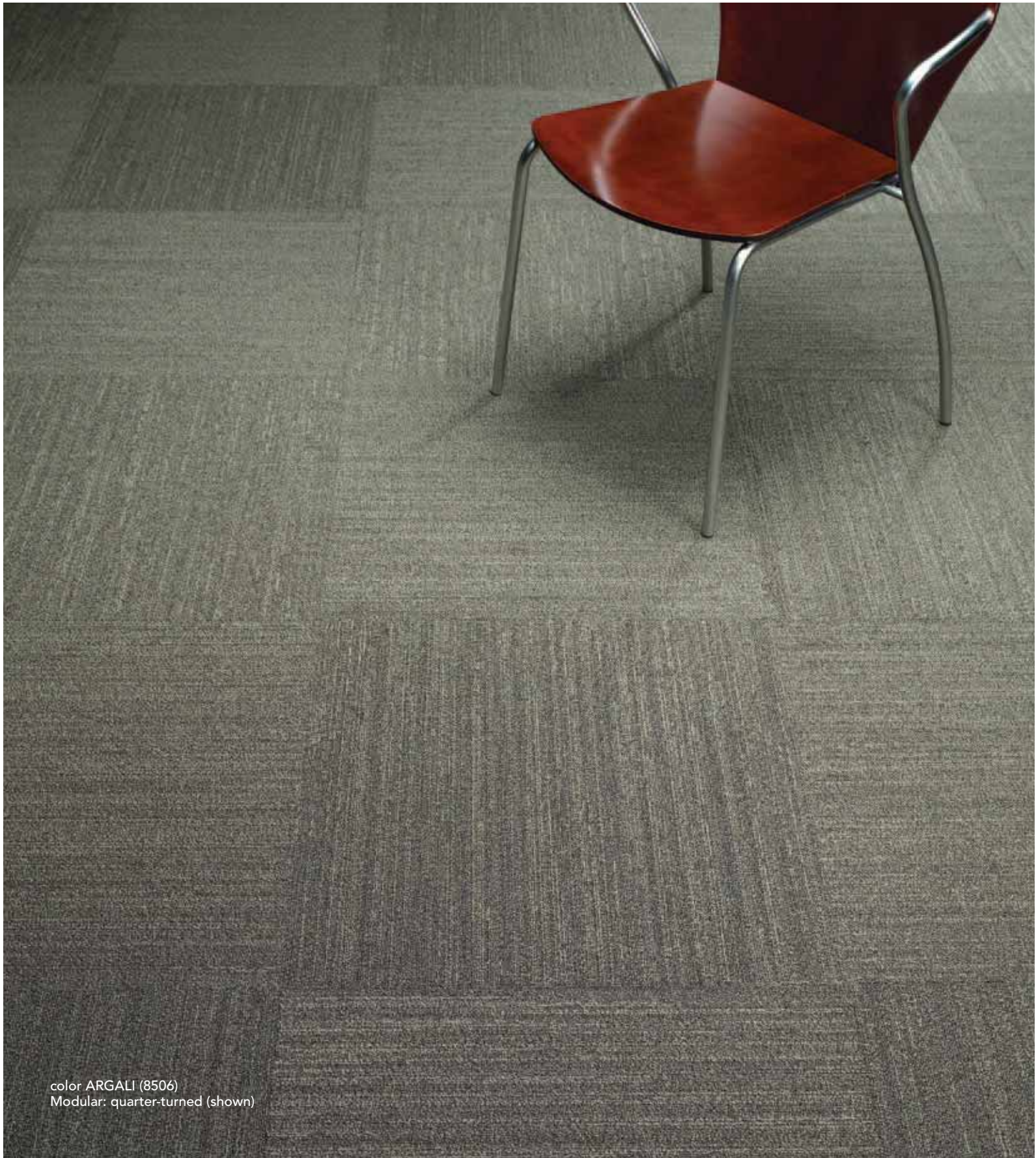
color ARGALI (8506) Modular: quarter-turned (shown)