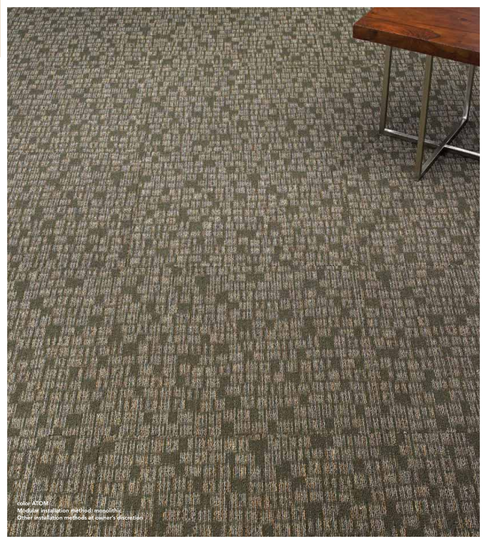
color ATOM Modular installation method: monolithic Other installation methods at owner's discretion